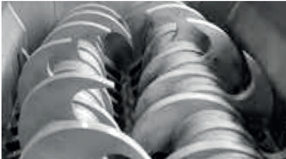
Twin (double) claw crusher