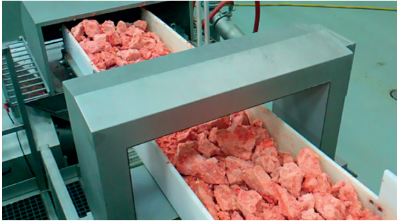
Picture showing meat raw material being discharged from the scansteel foodtech single- and twin crusher.