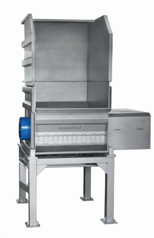
scansteel foodtech Whole Pallet Crusher – Single (shown with sub frame)

Both crushers have a tight claw design (knife configuration) which ensures the output of the meat raw material particle size has quite small particles. (see below).