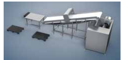
For feeding of frozen blocks: optional inclined belt conveyor w/metal detector

scansteel foodtech supplies the World's largest grinder programme for high quality and high volume grinding. The MG 400 Wolfman with its Ø400 mm knife set grinds frozen blocks, frozen or fresh pork skin, as well as all kinds of fresh raw material.